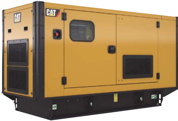
Enclosure pictured may include optional accessories